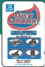
Item# 7508 8 lb. / 3.63 kg