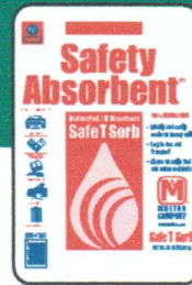
Item# 7951 50 lb. / 22.68 kg